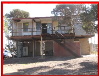
Whyalla Club House