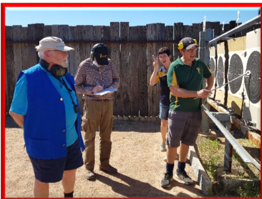
On the scoring line

With the Delta variant of COVID throwing some states into lockdown and with COVID positive truck drivers creating hot spots in this state, including a truck stop in Port Augusta, it was a bit of a worrying time leading up to this event. Would the state go into full lockdown, would we be able to even hold the event?