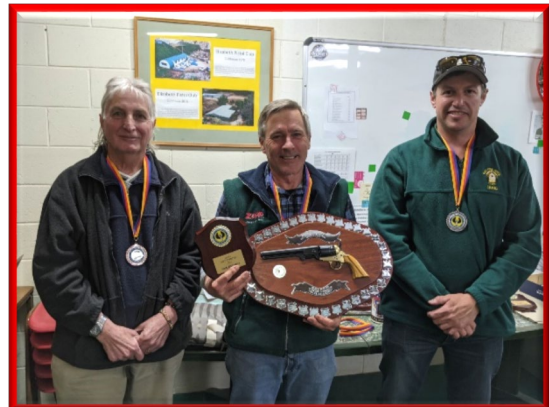
25m 1, 2, 3