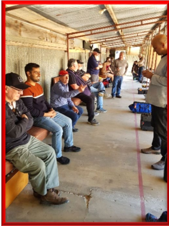
The ranges were busy

something to be proud of. In all, there were around 60 competitors from South Australia, with some disappointed interstate visitors keen to attend but unable to due to Covid restrictions.