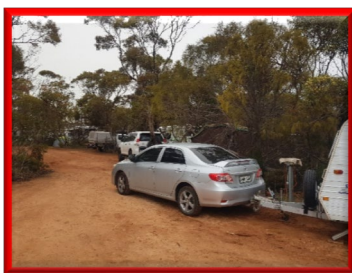
There were plenty of campers

It was great to see the championship (Off-gun) winners shared around this year - there were different individual winners in each category, the first time this has happened for many years.