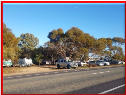
Car park was full

Sunday's presentations by mid-afternoon. Giving those with distance to travel a head start home. It was a first for our club to be able to fit all the 25M Standard Pistol entrants into one detail spread over 3 ranges.