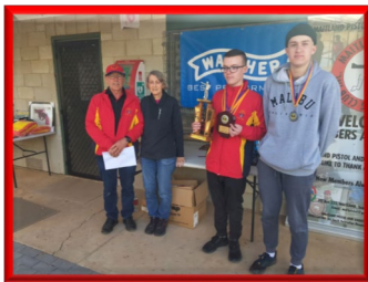
Junior Men 25m Pistol