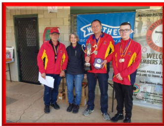
Men's Air Pistol