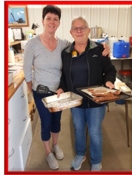
And just like that it was gone!