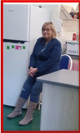
The Chippie Queen

The SARPA Black Powder State Championships and Air Pistol Open was hosted by Elizabeth Pistol Club on 21 st August.