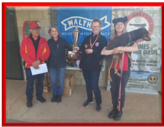
25m Pistol Women

25m Pistol Junior: 1 st Tyson Hughes (Penfield); 2 nd CJ Ismail (Noarlunga).