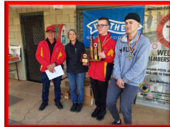
Junior men's 10m Air Pistol